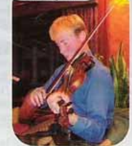
Fiddler at work at Kyle.

The Royal Scotsman operates a range of journeys from one to seven nights each summer season. Tel. 0131 555 1344 for further information, or visit the website: www.royalscotsman.com .