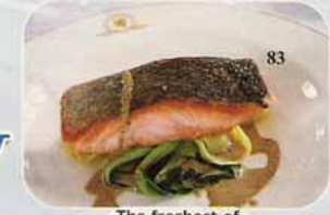
The freshest of local produce!

Then there was the return rail journey to Carrbridge, through mesmerising scenery, and the observation car became the most popular place on the train once again. Dinner was a formal affair