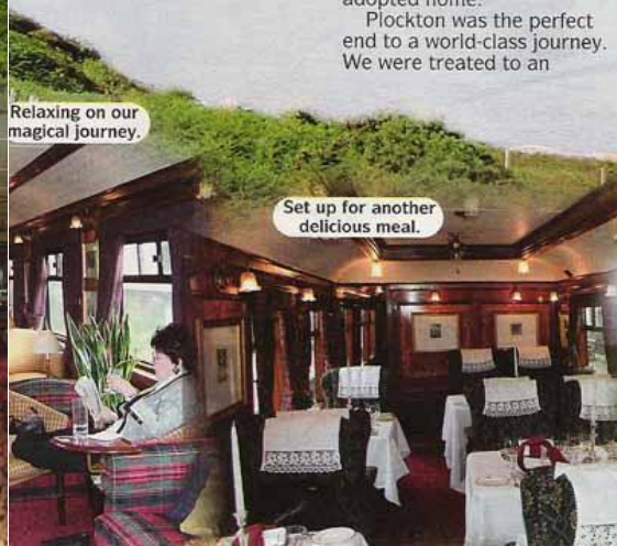
Relaxing on our magical journey.